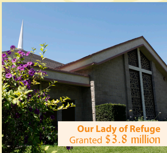
Our Lady of Refuge Granted $3.8 million