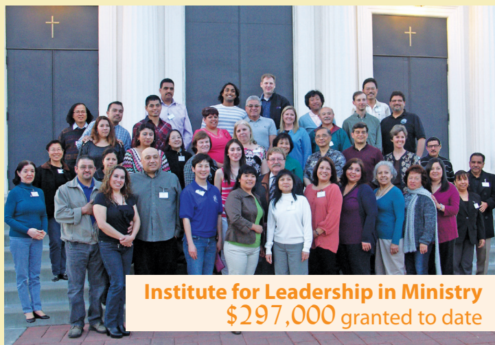
Institute for Leadership in Ministry $297,000 granted to date