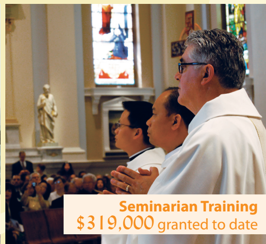
Seminarian Training $319,000 granted to date

Together we are creating Forever Value for Catholic ministries.