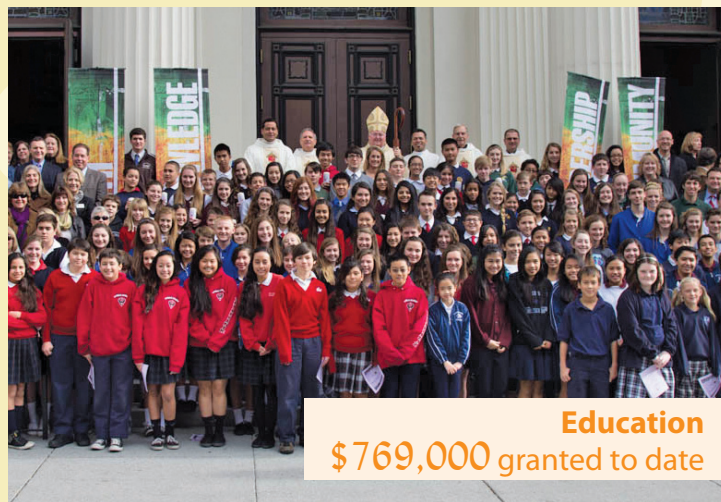
Education $769,000 granted to date