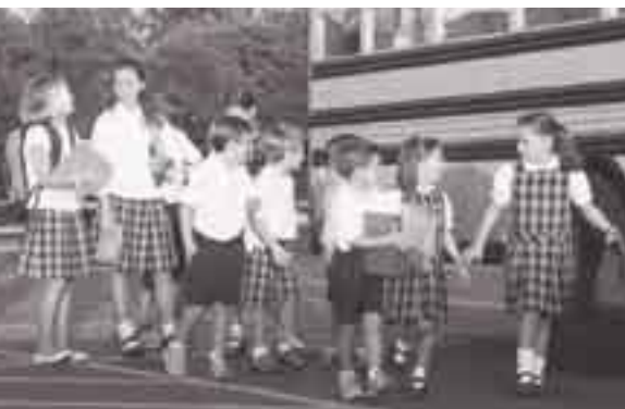
Funds granted for Catholic Tuition Reimbursement from the Catholic Foundation will allow diocesan schools to offer higher levels of tuition assistance for the 2009-2010 school year.

If you would like to make your pledge payment online, or have questions or comments, please contact us at 408-995-5219, or visit our web site at www.cfoscc.org . Online payments are more convenient and reduces paper waste which helps protect our environment.